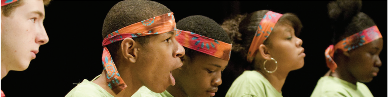
Beyond 3:30 participants