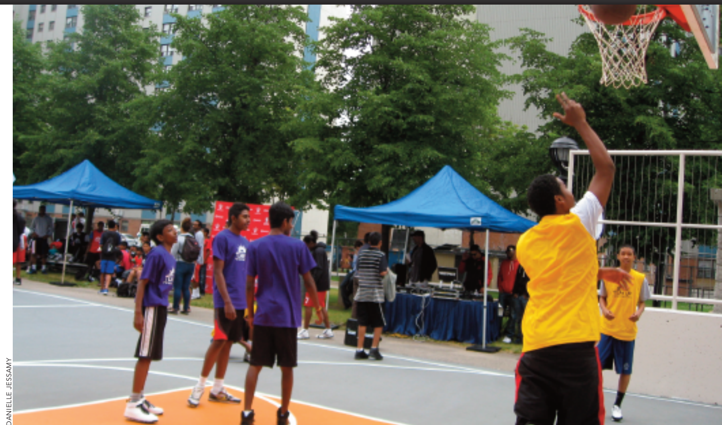
Youth from St. James Town take part in a three-on-three game organized by MLSE Team Up Foundation at the launch of the newly refurbished neighbourhood basketball court through "Recipe for Community".

TCF brings donors together with private enterprises, government and community partners to create some of Toronto's most innovative programs. Thanks in part to TCF, 'Recipe for Community' can help inner city residents come together and build a crucial sense of belonging, while 'Beyond 3:30' provides high-quality after-school programming—free of charge—to students in some of Toronto's underserved neighbourhoods. And through