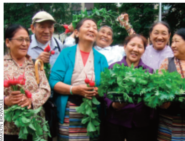
A group of Tibetan newcomers harvest vegetables from their Greenest City Community Garden plot, as part of their ESL class activities.

The CKC is a natural complement to Toronto's Vital Signs®, TCF's annual report identifying issues affecting city residents. Vital Signs highlights concerns, while the CKC highlights Toronto organizations working on